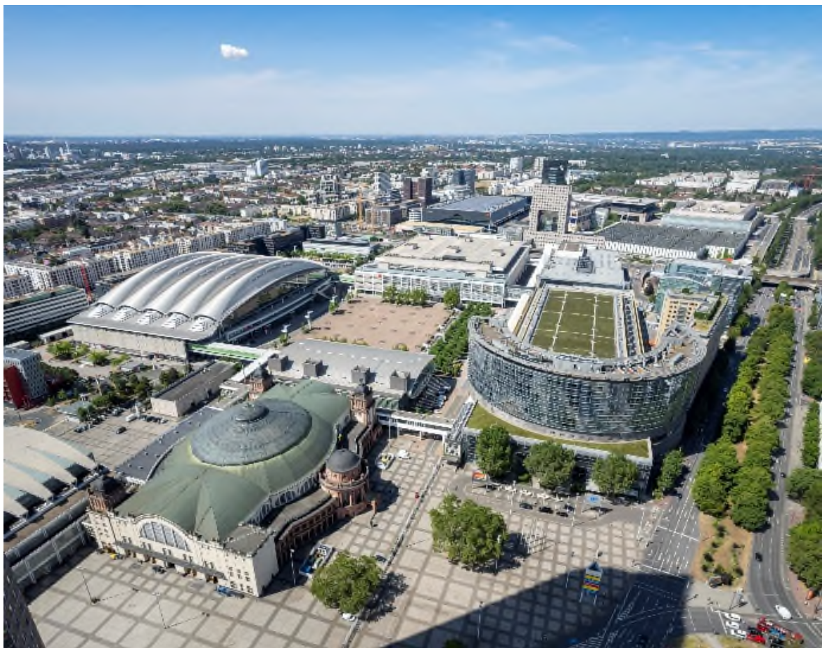
Messe Frankfurt – Terrain overview

This year sees the German Sustainability Award being presented by the DNP Foundation for the 16th time. The award honours outstanding efforts to bring about the transformation to a sustainable future and takes into account above all ecological and social aspects. It is seen as Europe's greatest award for ecological and social commitment. This year, companies from 100 sectors have been nominated because of their exemplary and effective contributions to sustainable transformation in the long term. Also nominated with Messe Frankfurt are Hamburg Messe und Congress, NürnbergMesse and Messe Stuttgart in the "Leisure and Events" category for the "Event and Trade Fair Industry" sector. The prizes are awarded together with the Association of German Chambers of Industry and Commerce (DIHK), the Federal Ministry for the Environment and other partners. The award presentation will take place in Düsseldorf on 23 November 2023.